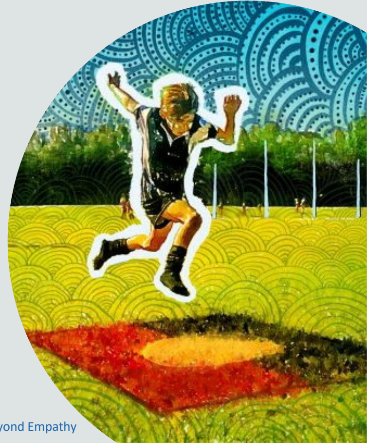
Artwork: Beyond Empathy

Zurich acknowledges the Traditional Custodians of country throughout Australia and their connections to land, sea and community. We pay our respect to their Elders past and present and extend that respect to all Aboriginal and Torres Strait Islander peoples today.